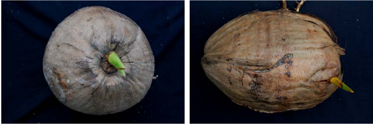
(a) Germinating mature coconut fruits