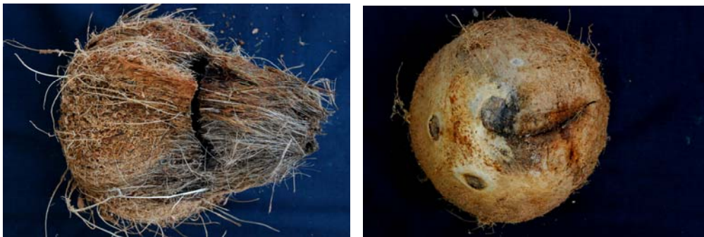
(b) Dehusked mature coconut with crack scars