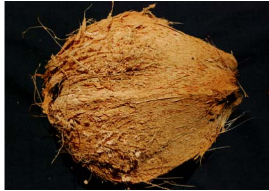
(b) Semi-dehusked mature coconut