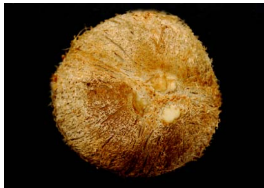
(d) Fully dehusked mature coconut