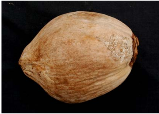
(a) Whole mature coconut