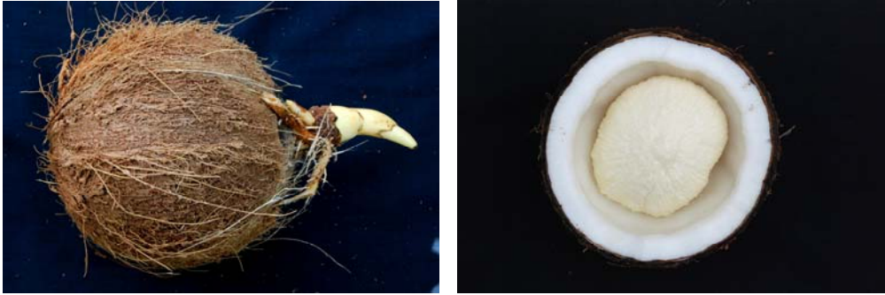
(a) Germinating dehusked mature coconut (left picture), cotyledon shown after crosscut opened (right picture)