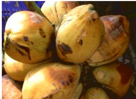
Figure B.1 Mature coconut fruit peel of brown or crab claw like colour

Source: Narong Chomchaloa. B.E. 2551. Coconut Glossary: Dictionary explaining definition of coconut glossaries. Thailand Network for the Conservation and Enhancement of Landraces of Cultivated Plants. Published under the project on enhancement of taxonomy efficiency and world strategy on plant conservation. Bureau of Policy and Plan of Environment and Natural Resources. (Figure B.1.)