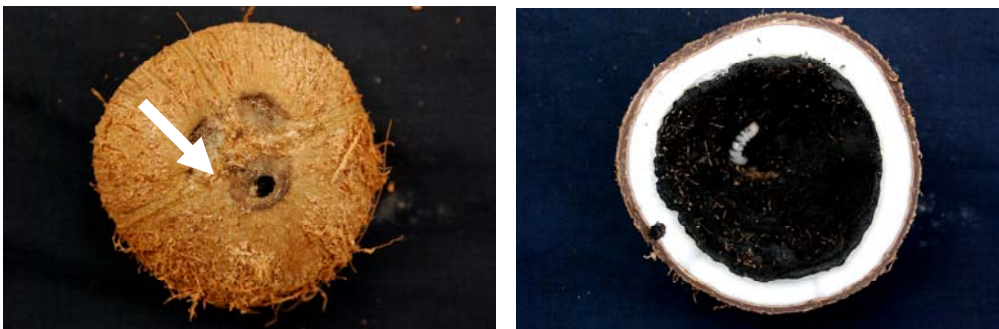
(c) Dehusked mature coconut with open hilum (left picture), mould and a larva are revealed after cut opened (right picture)