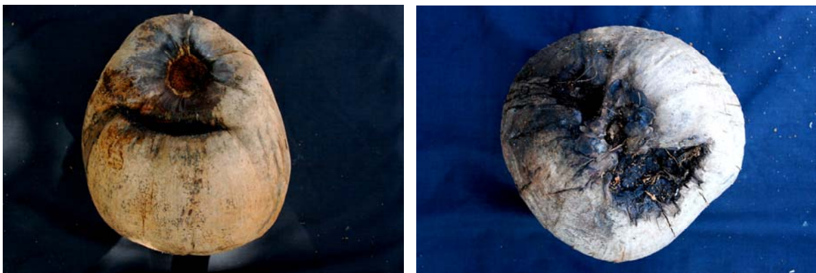
(b) Mature coconut fruit with crack scar