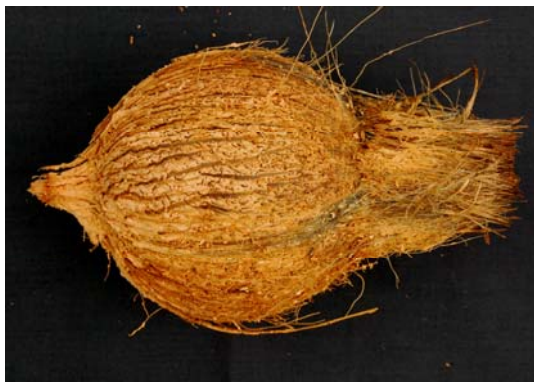
(c) Dehusked mature coconut except the perianth area